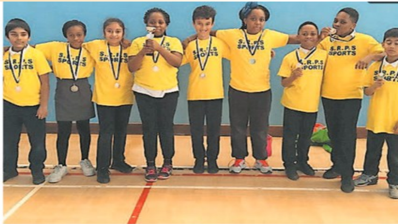
Southern Road pupils face the camera after winning the Cumberland SSP dance competition.

Next Week Tuesday 9th January • Year 6 trip to East Ham cemetery Wednesday 10th January • Newham Recorder coming in to take Reception class photos. Thursday 11th January • Space workshop for Reception children (in school) Friday 12th January • Year 5 fire safety talk.