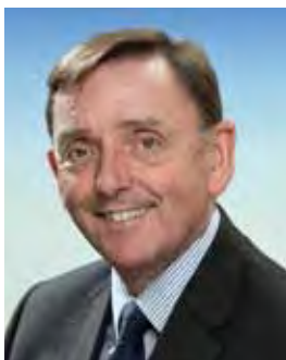
Sir Robin Wales Mayor of Newham

We look forward to welcoming your child to one of our secondary schools and to supporting them in achieving their potential.