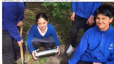
Pupils from Southern Road Primary School in Plaistow have planted a time capsule filled with their reflections on the pandemic.