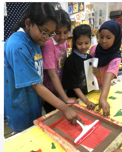
Year 4 Screen printing this week.