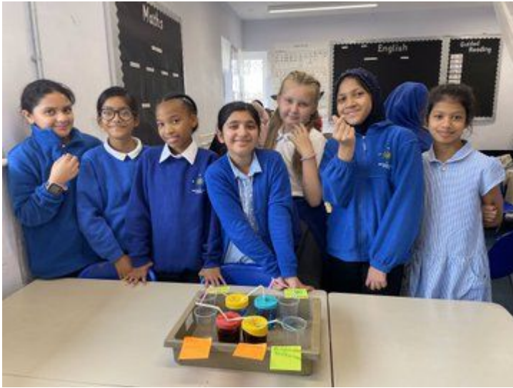
Year 6 made models of the circulatory system.