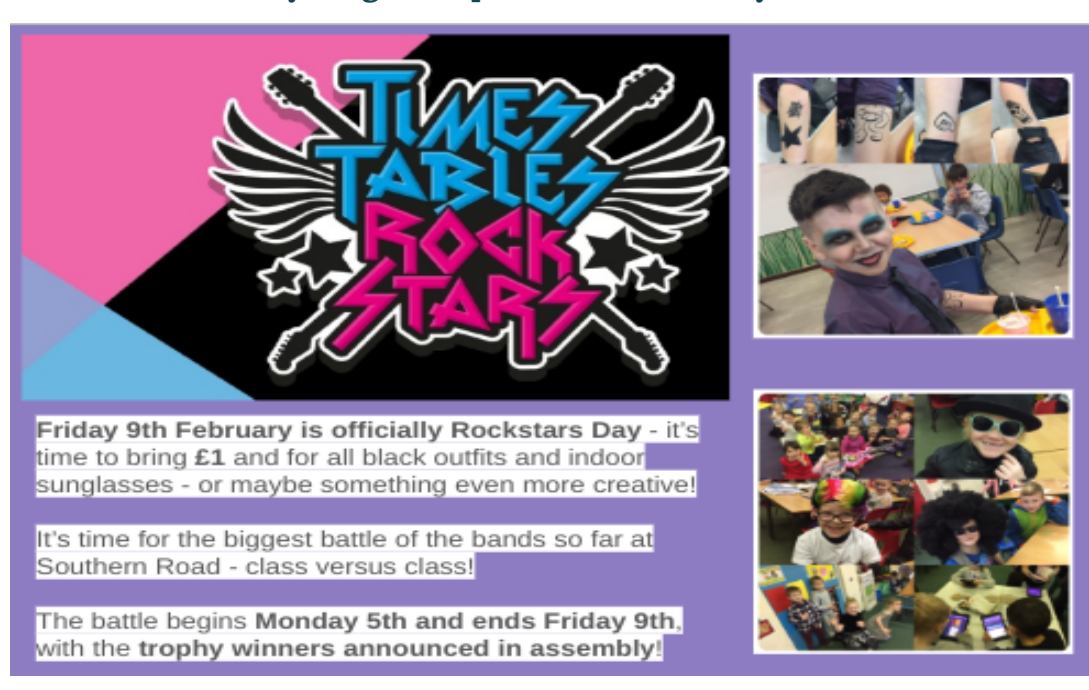
Key Stage 2 Pupils on Number Day

If you need any further information, please do not hesitate to contact your child's class teacher.